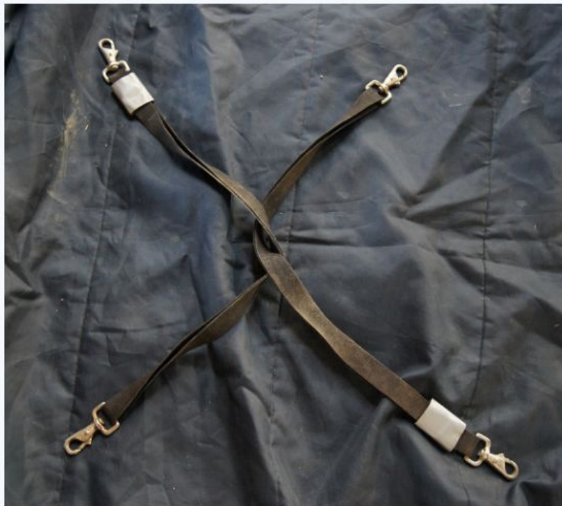
Method to securely fasten leg straps. This is how the final result should look underneath your horse. Simply loop one strap through the other when fastening.