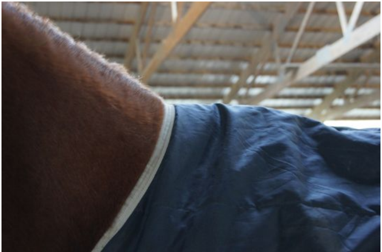
Properly adjusted blanket resting in front of the withers.

The withers are especially sensitive and great care should be taken to ensure that the blanket sits just in front of them instead of exerting downward force on the bony wither area. I like to insert my hand beneath the blanket and run it gently all the way from the blanket's chest buckles to the horse's withers, keeping an eye out for any areas of excessive pressure; If it's pinching my hand, then there's no way that blanket is going to be comfortable for the horse.